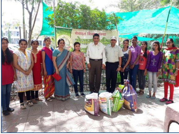
Grain donation by Alumni of the Institution