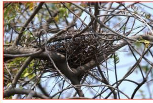
Nest of House crow