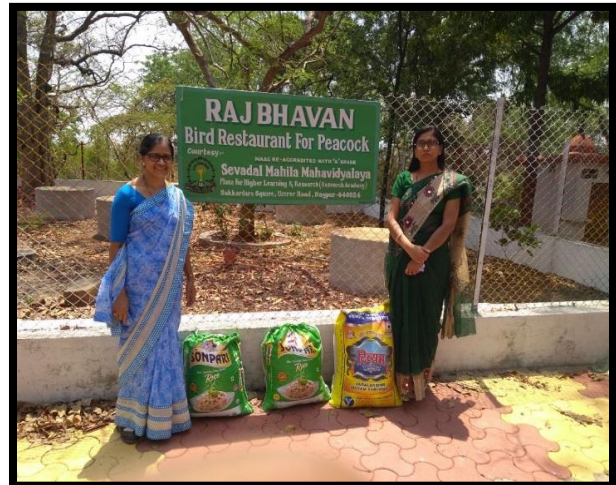
Grain Donations to Raj Bhavan, Nagpur.