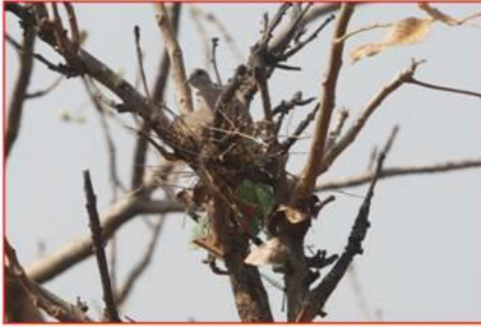
Nest of Red collared dove