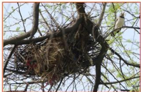
Nest of House crow