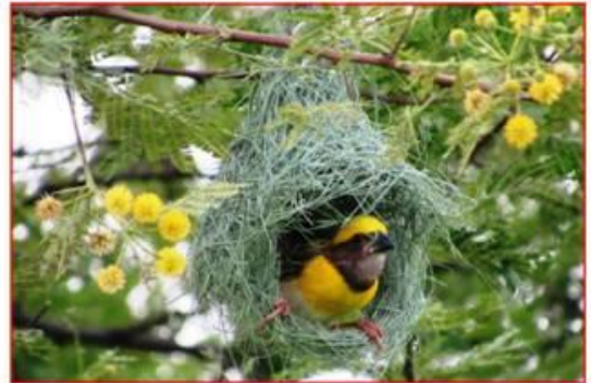
Nest of Baya Weaver