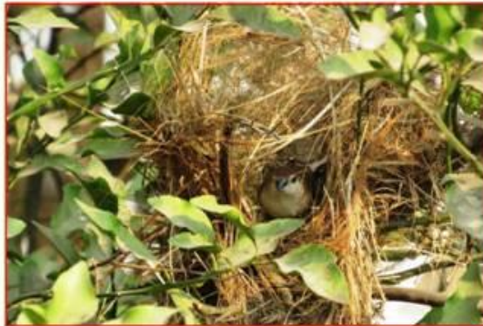
Nest of white throated Munia