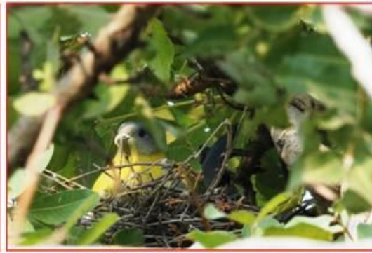
Nest of Yellow footed green pigeon