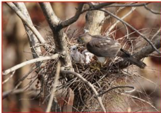
Nest of Shikra