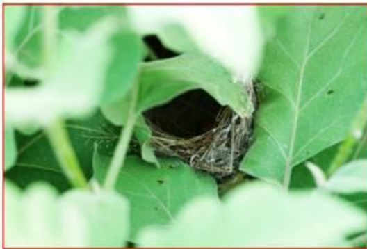
Nest of Tailor bird