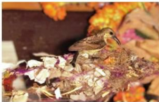
Nest of Tailor bird