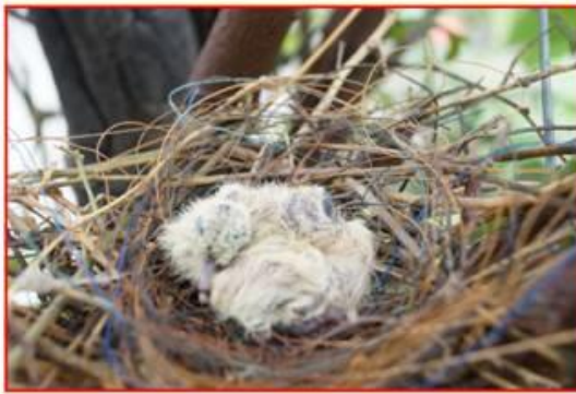
Nest of Little brown dove