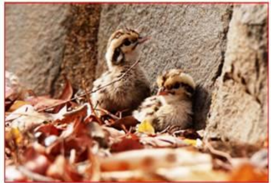
Young Chicks of Grey Partridge