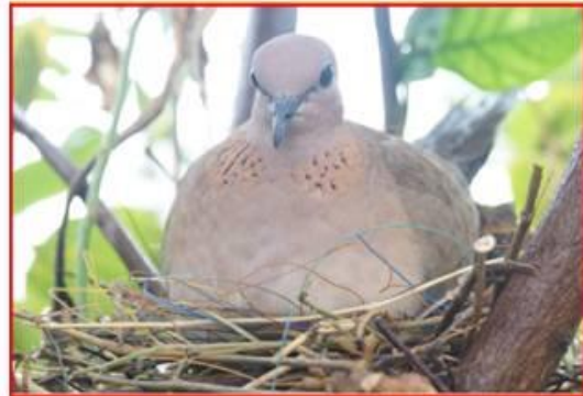
Nest of Little brown dove