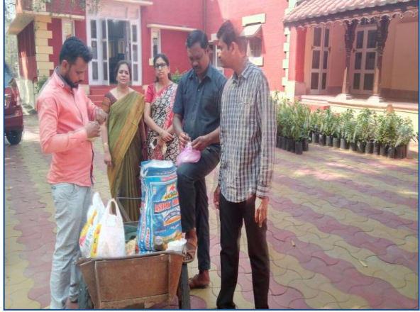
Raj Bhavan employees receiving the donated grains